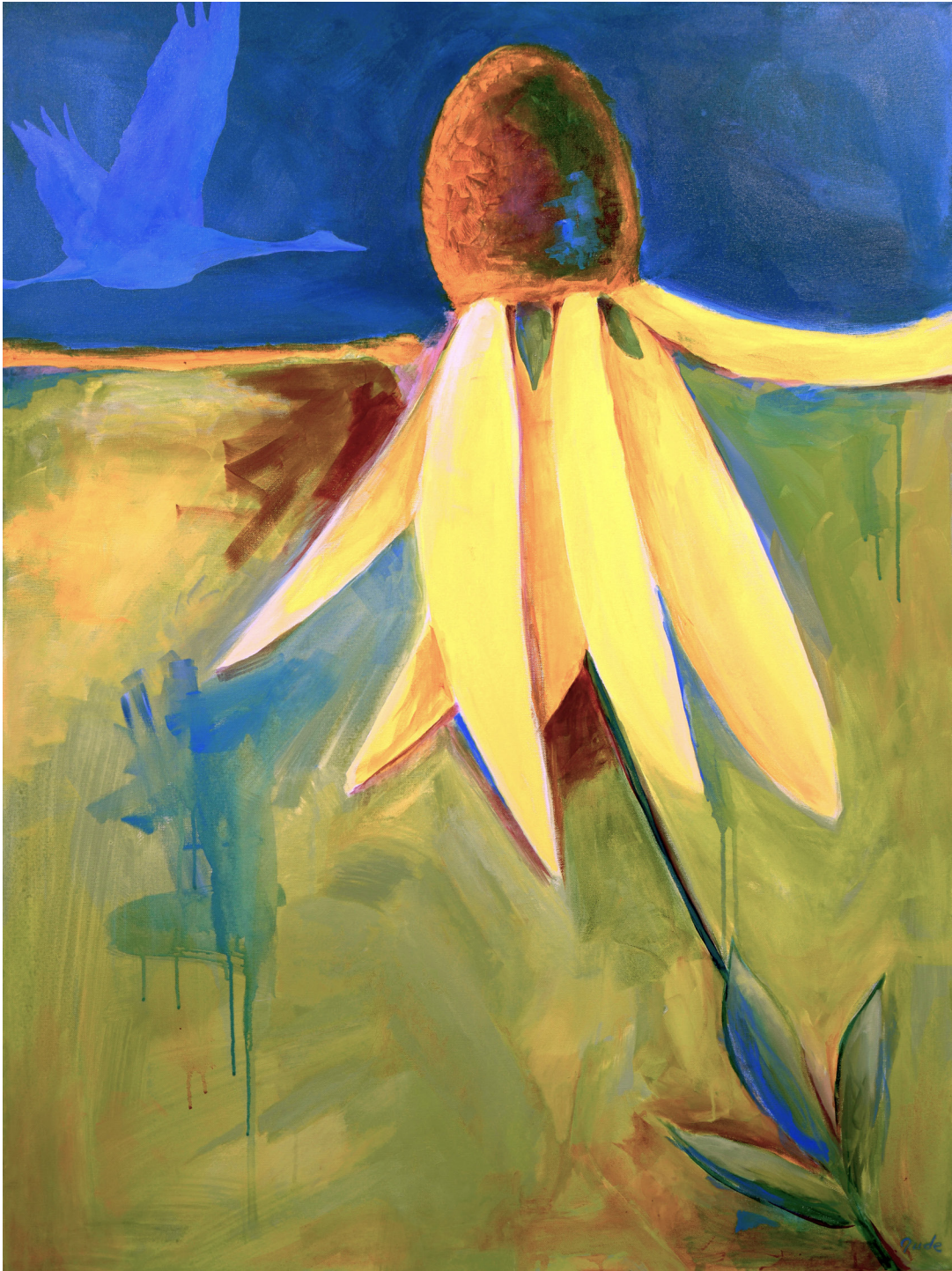
Prairie Dream 2018 Acrylic on canvas

Sandhill cranes nested in Nebraska until the early twentieth century. The flying crane in the background of Prairie Dream is ethereal, commemorating this once common summer resident.