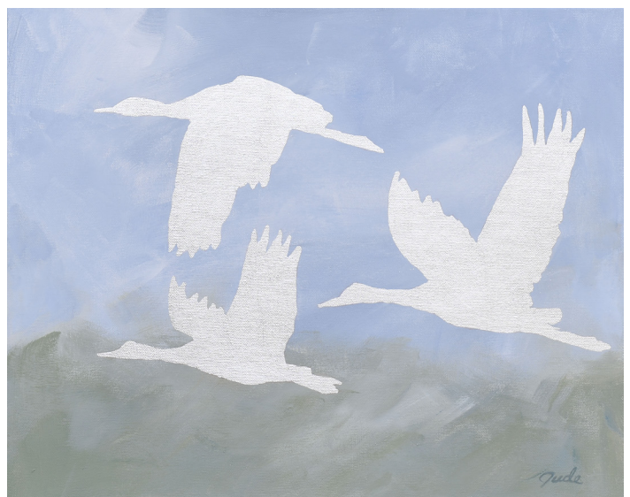
Homeward Bound 2018

Acrylic and gold, aluminum, and copper leaf on canvas