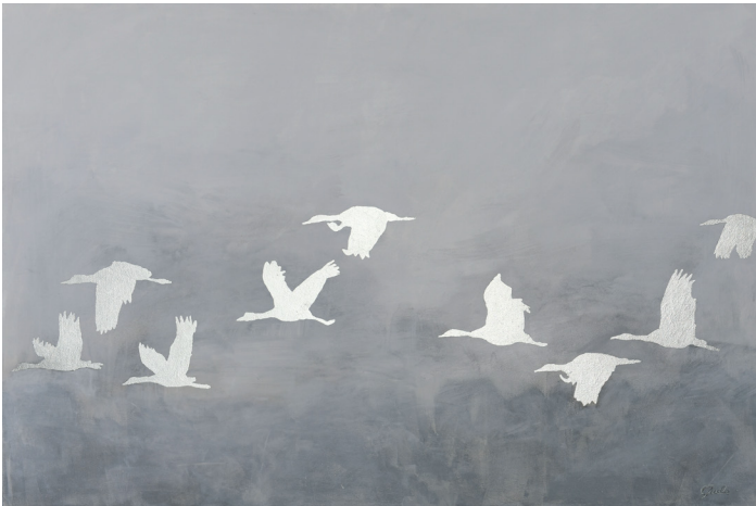
Passing Through #2 2019 Silver leaf and acrylic on canvas