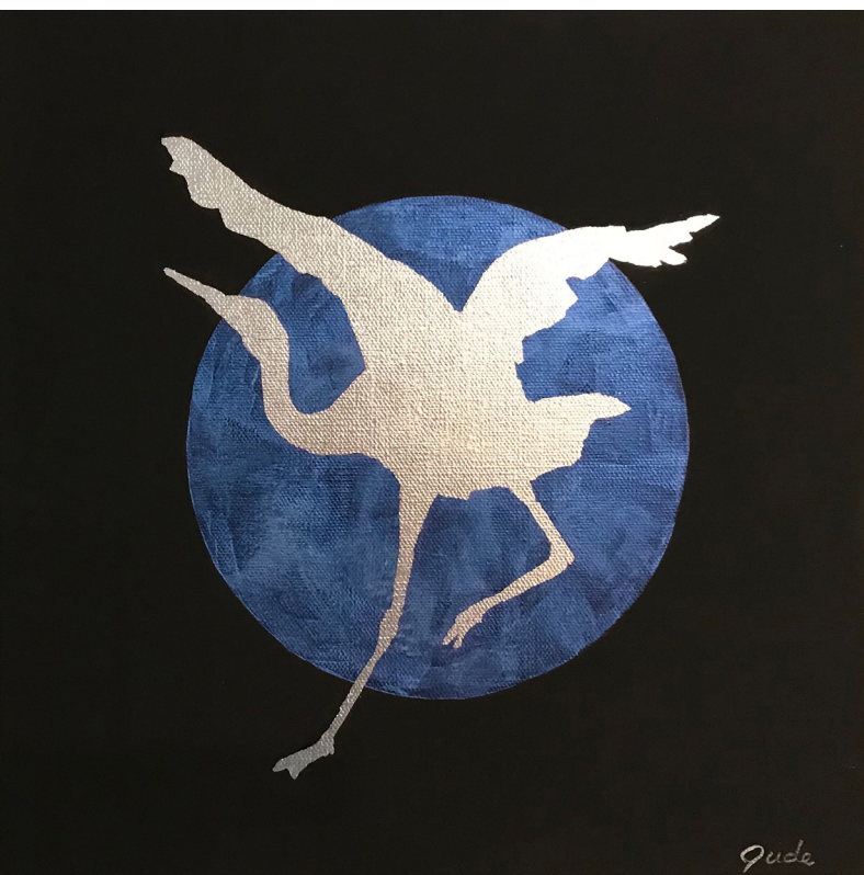
Blue Moon #2 2018 Aluminum leaf and acrylic on canvas