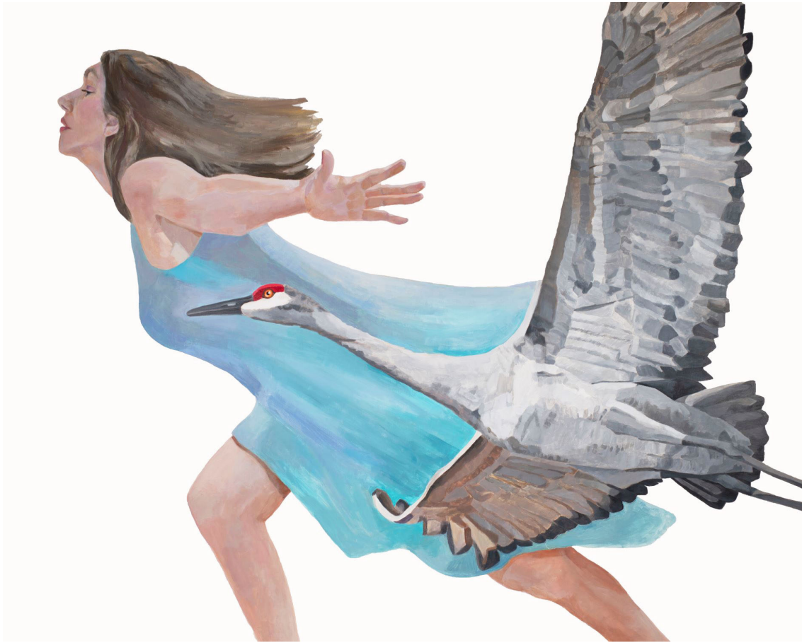
Flying Free 2019 Acrylic on canvas

Avian perceptions and thoughts are of course different from ours, but their actions resonate with our sense of self and purpose. To know the cranes is to know of shared experiences, shared emotions, shared goals, to know that life's adventures are not ours alone.