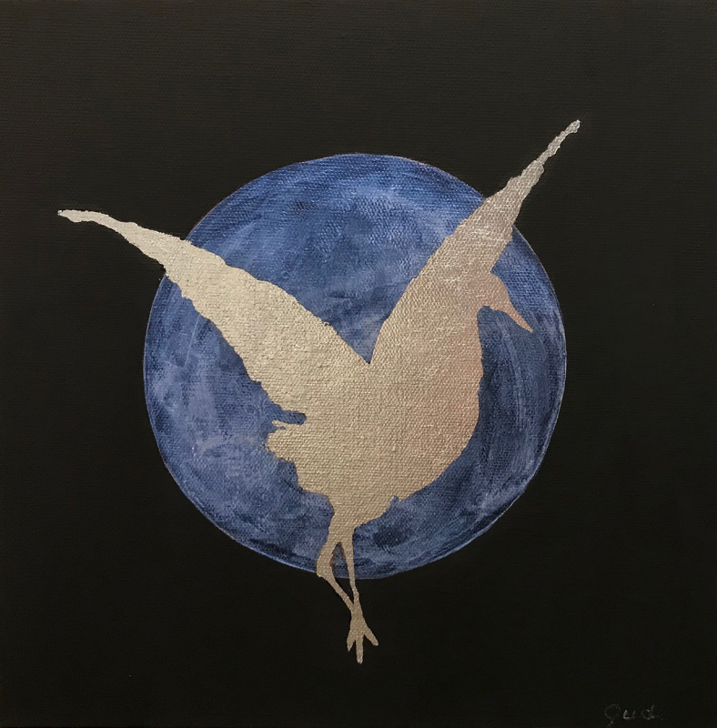
Blue Moon #1 2018 Aluminum leaf and acrylic on canvas