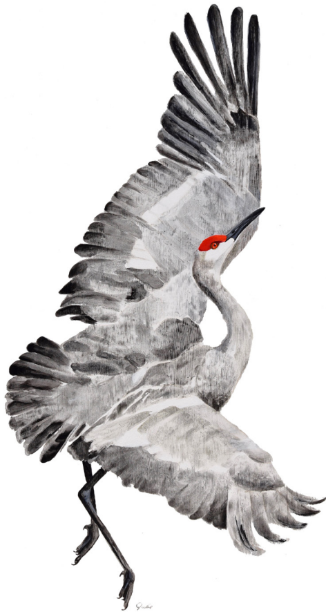
Crane Fever #1 2016 Acrylic and textured gesso on canvas

Some crane behaviors have been around for millions of years—these birds are often portrayed as primordial. But they never stopped evolving, and still push the limits of their physical capabilities. Challenging each other with their athleticism, jumping can be infectious as it spreads through the group.