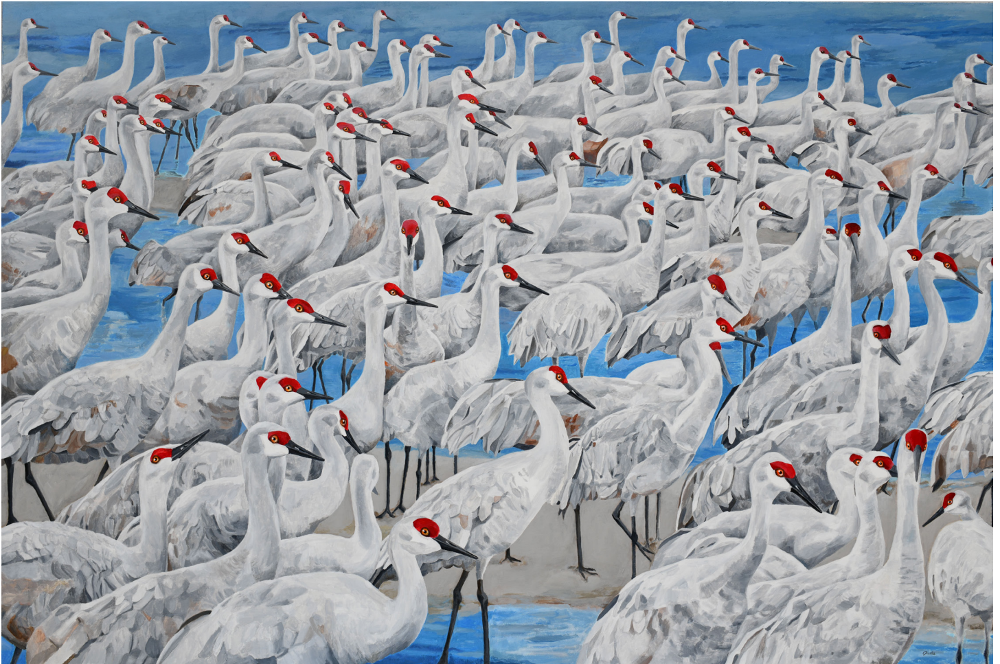
The Flock 2020 Acrylic on canvas

At times, tens of thousands of Sandhill cranes fill stretches of the Platte River as far as the eye can see. These birds spend the night standing on sand bars in shallow water for protection from predators.