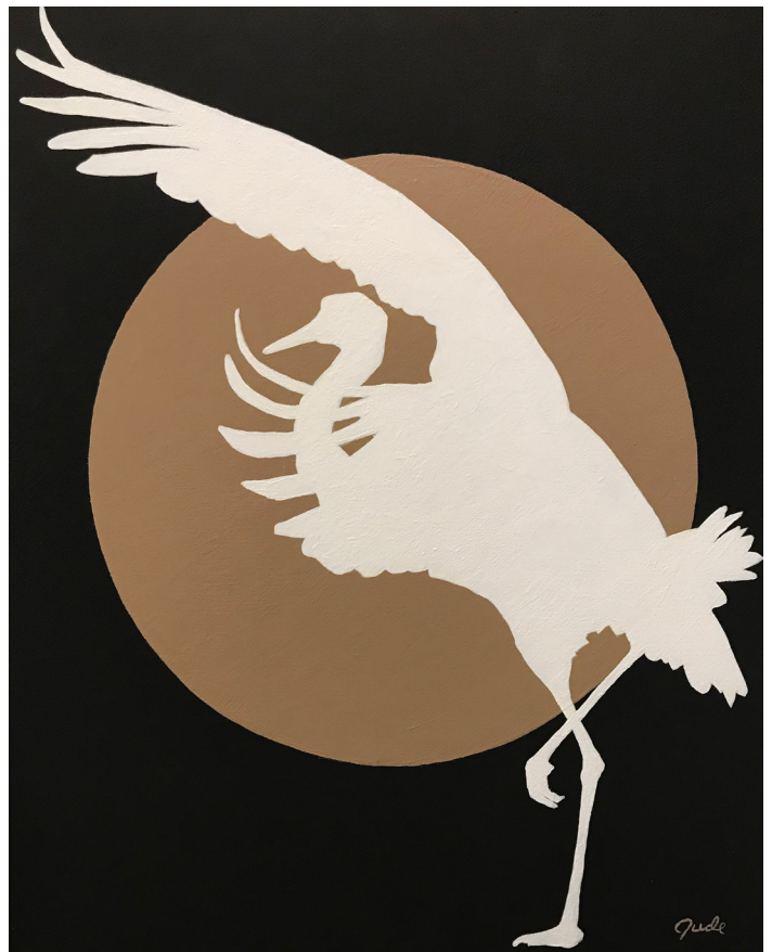
Moon Dance 2018 Acrylic on canvas