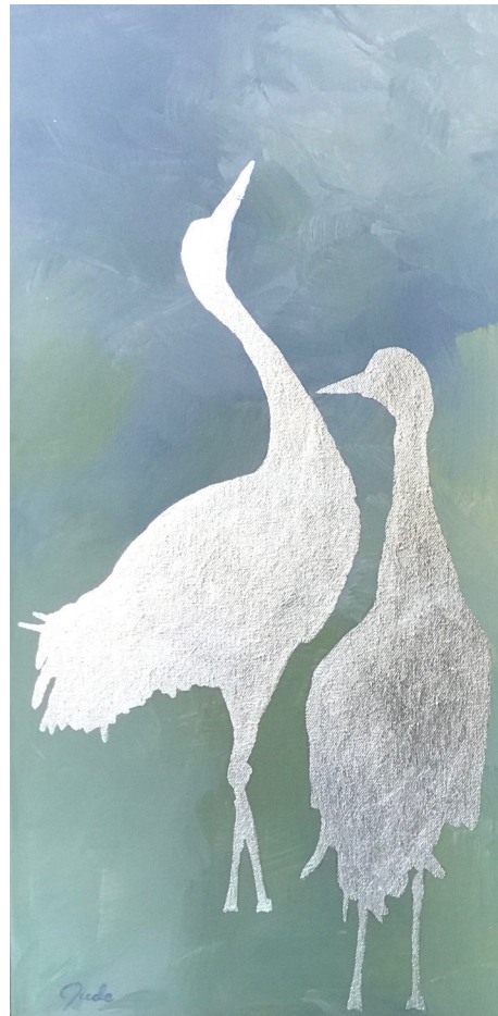
Mates for Life 2019 Silver leaf and acrylic on canvas