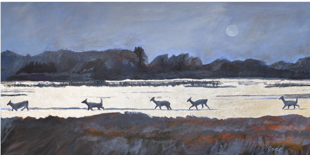
Moonlit Walk 2020 Aluminum leaf and acrylic on canvas