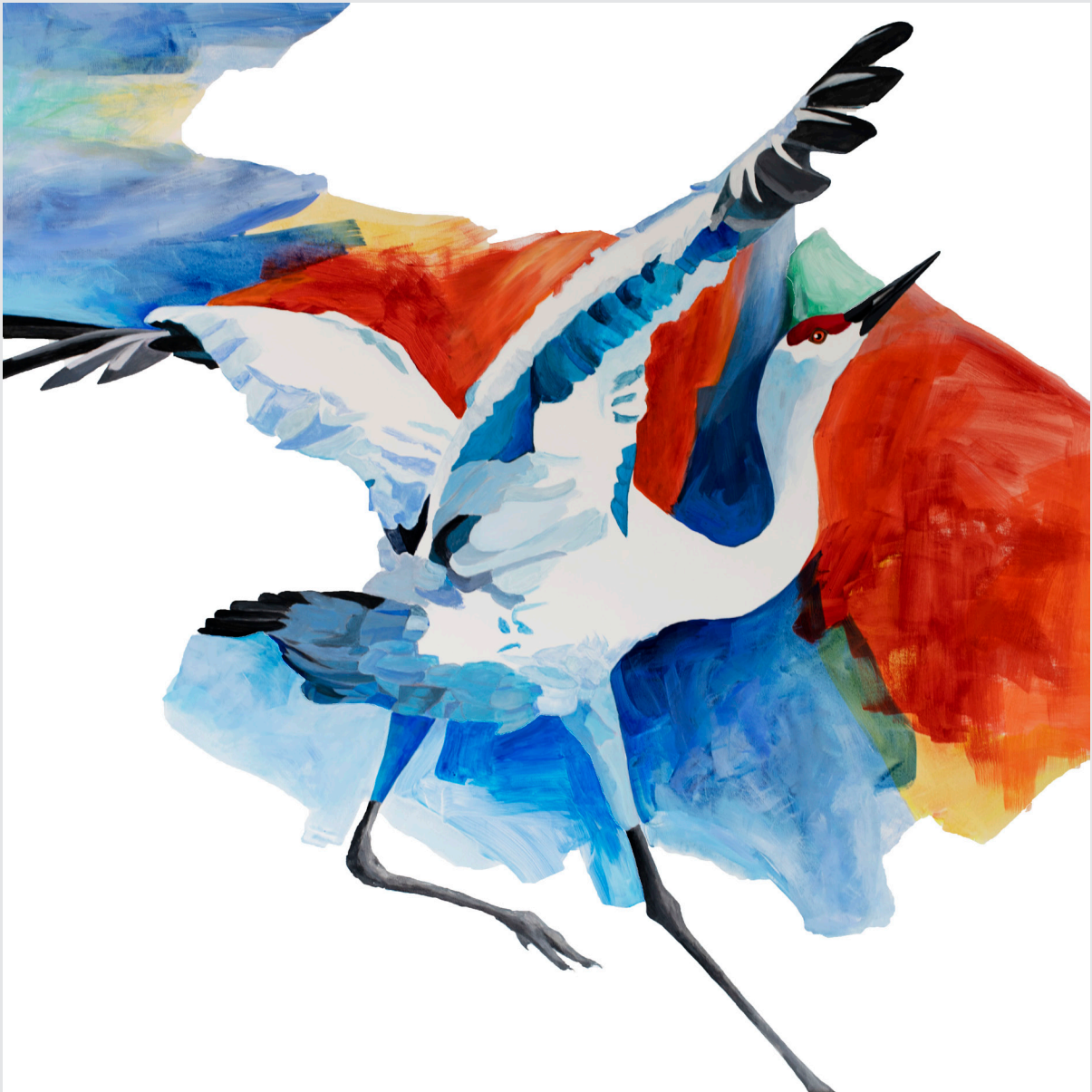
Thrill of the Dance 2017 Acrylic on canvas

Both sexes dance. It takes a lot of learning and practice for young birds to get good at it. Some basic dance moves are ubiquitous, but individuals add their own style and possibly unique moves.