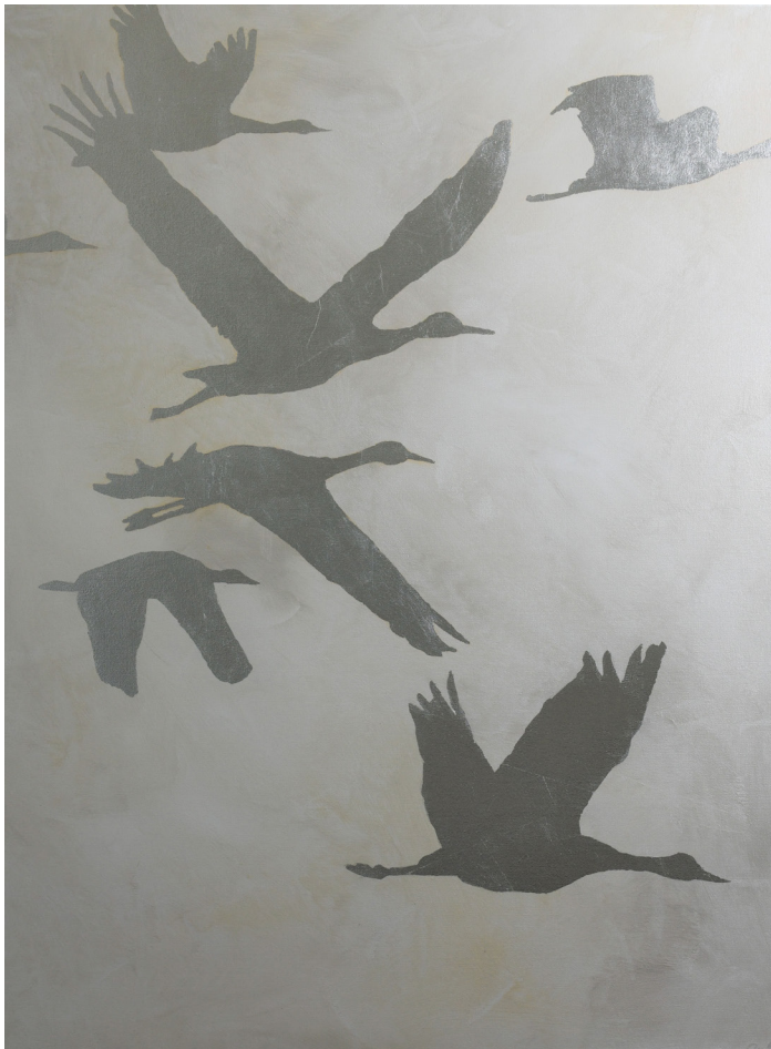
Passing Through 2019