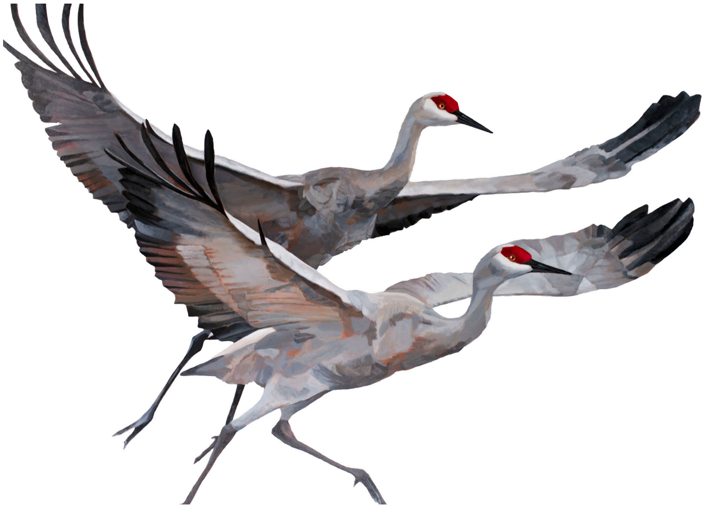
Synchronicity 2018 Acrylic on canvas

Sandhill cranes mate for life, and some live more than twenty years. Mates stay together year-round, keeping close to each other throughout migration even as they fly or roost in large flocks. They recognize each other's calls and are highly stressed if they become separated, calling and searching until reunited. Synchronicity portrays the emotional strength of this pair bond.