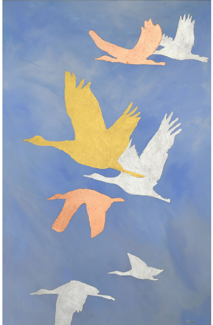
Springtime Joy 2020

The mid-continent population of Sandhill cranes migrates from southern wintering grounds to nesting territories in Canada, Alaska, and Siberia. They stop in Nebraska to rest and replenish their fat stores before continuing. Unlike most birds, cranes fly during the day on migration, and learn migration routes and food sources from their parents and other members of the flock.