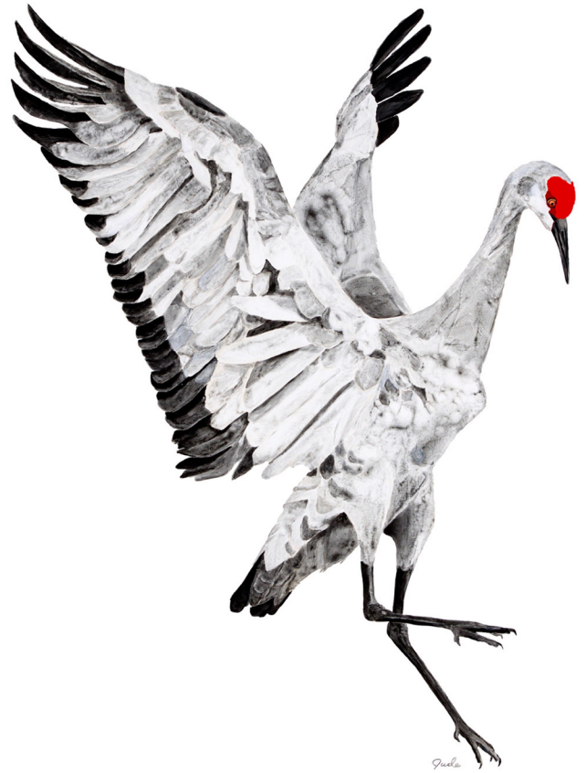
Crane Fever #2 2016 Acrylic on canvas