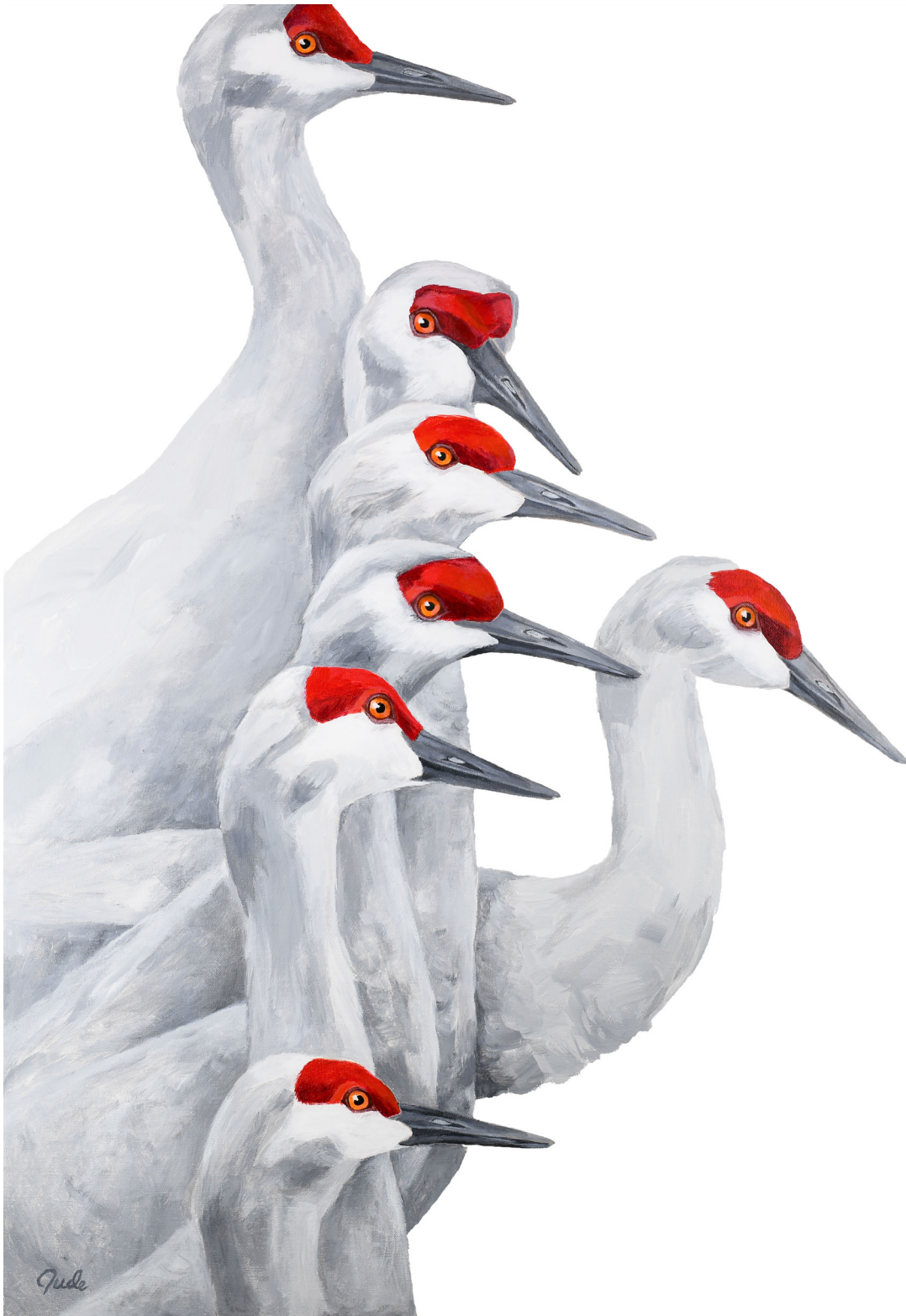
Seven Individuals 2017 Acrylic on canvas

Cranes are masters of body language, including facial expressions. The red crown is a patch of skin that changes in size and brightness to indicate interest or excitement.