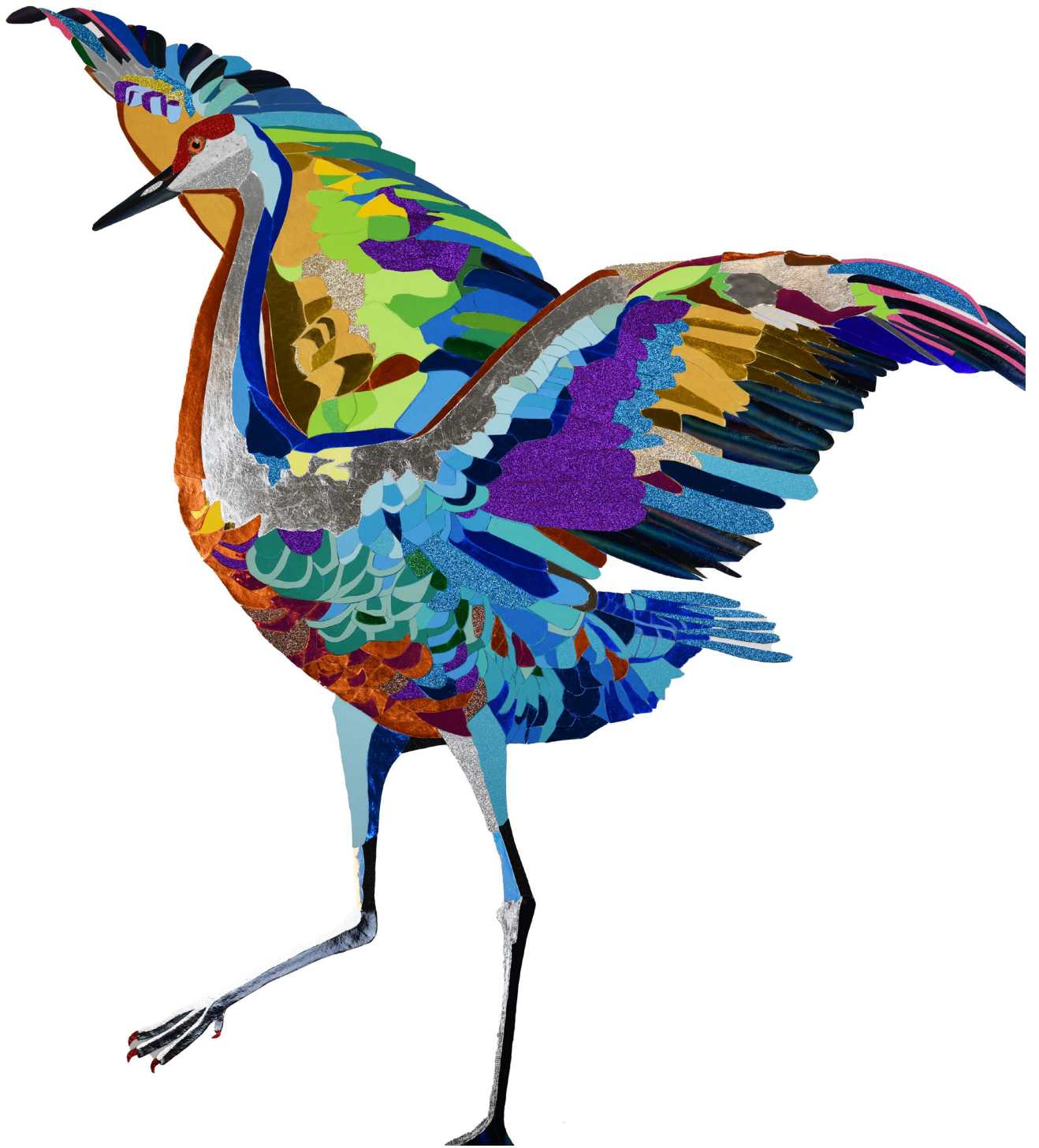
Dancing to the Technicolor Beat 2020

Acrylic, glitter and foil paper, aluminum leaf and vinyl on canvas