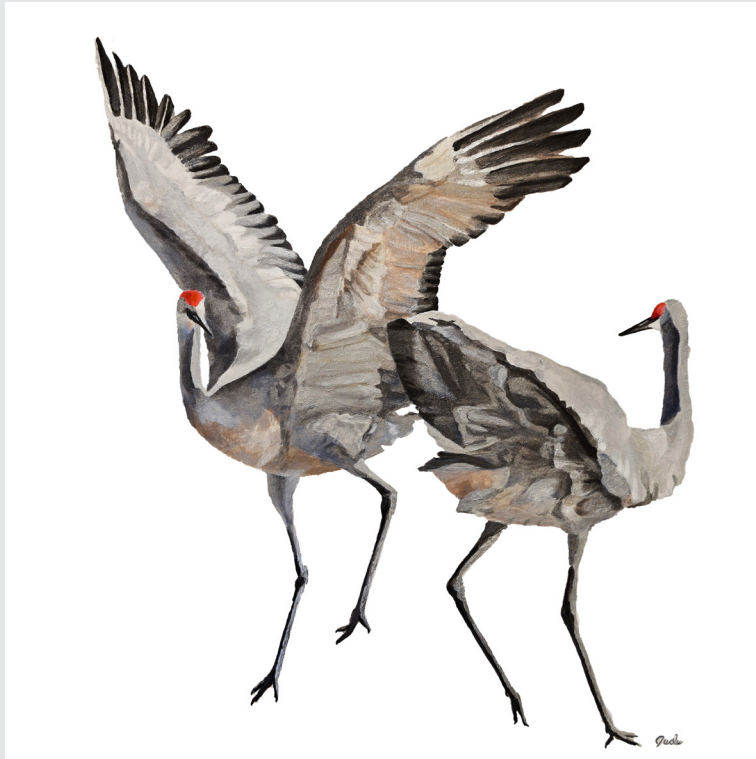
The Dance Begins