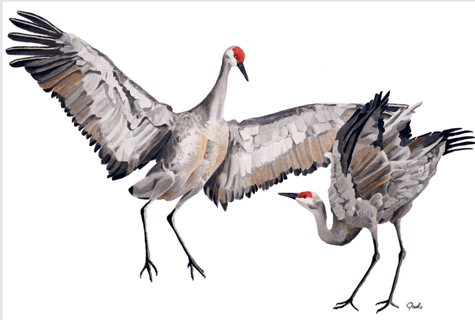
The Dance Continues

Iridescent stainless steel paint, iridescent and metallic acrylic, micaceous iron oxide and aluminum leaf on canvas