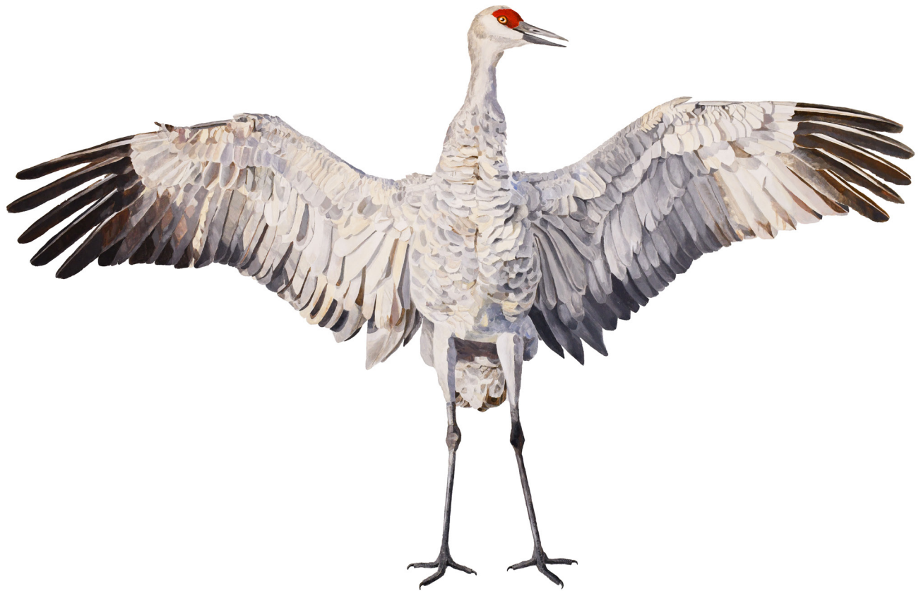
Showing Off 2020 Acrylic on canvas

This life-sized Sandhill crane is showing off the size and condition of his wings and feathers. It is a display often used when a crane lands in a crowd or is in the midst of a restless group. It can be a threat, but also a dance move. The ruffled neck is part of the show.