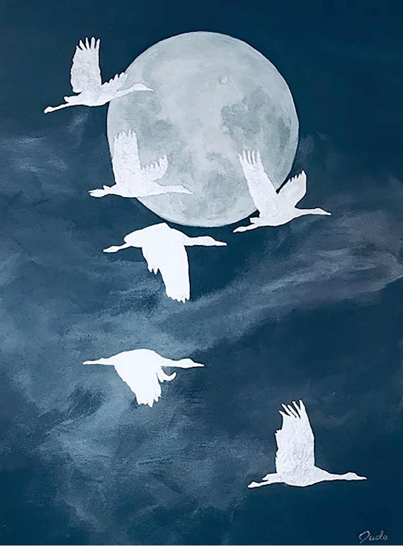
Moonlight Serenade 2019 Silver leaf and acrylic on canvas