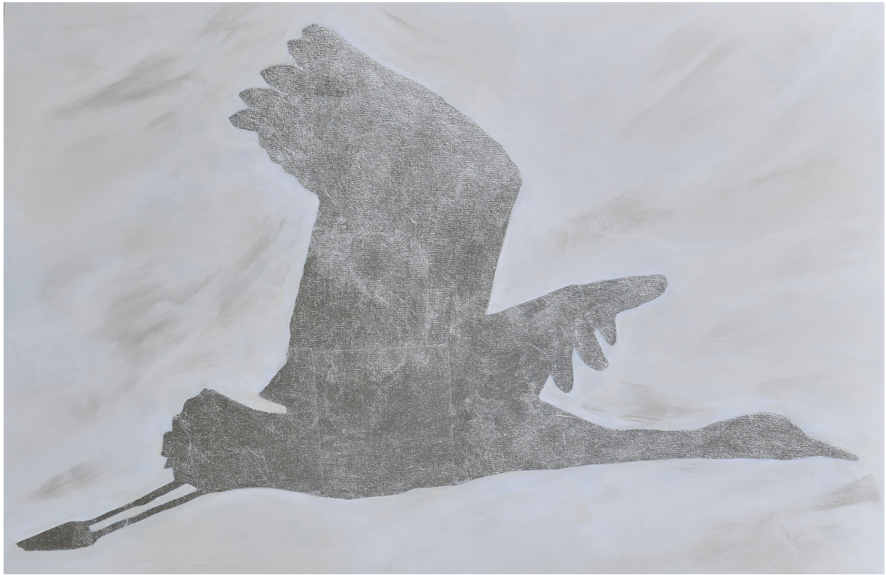
On Silver Wings 2018 Aluminum leaf and acrylic on canvas