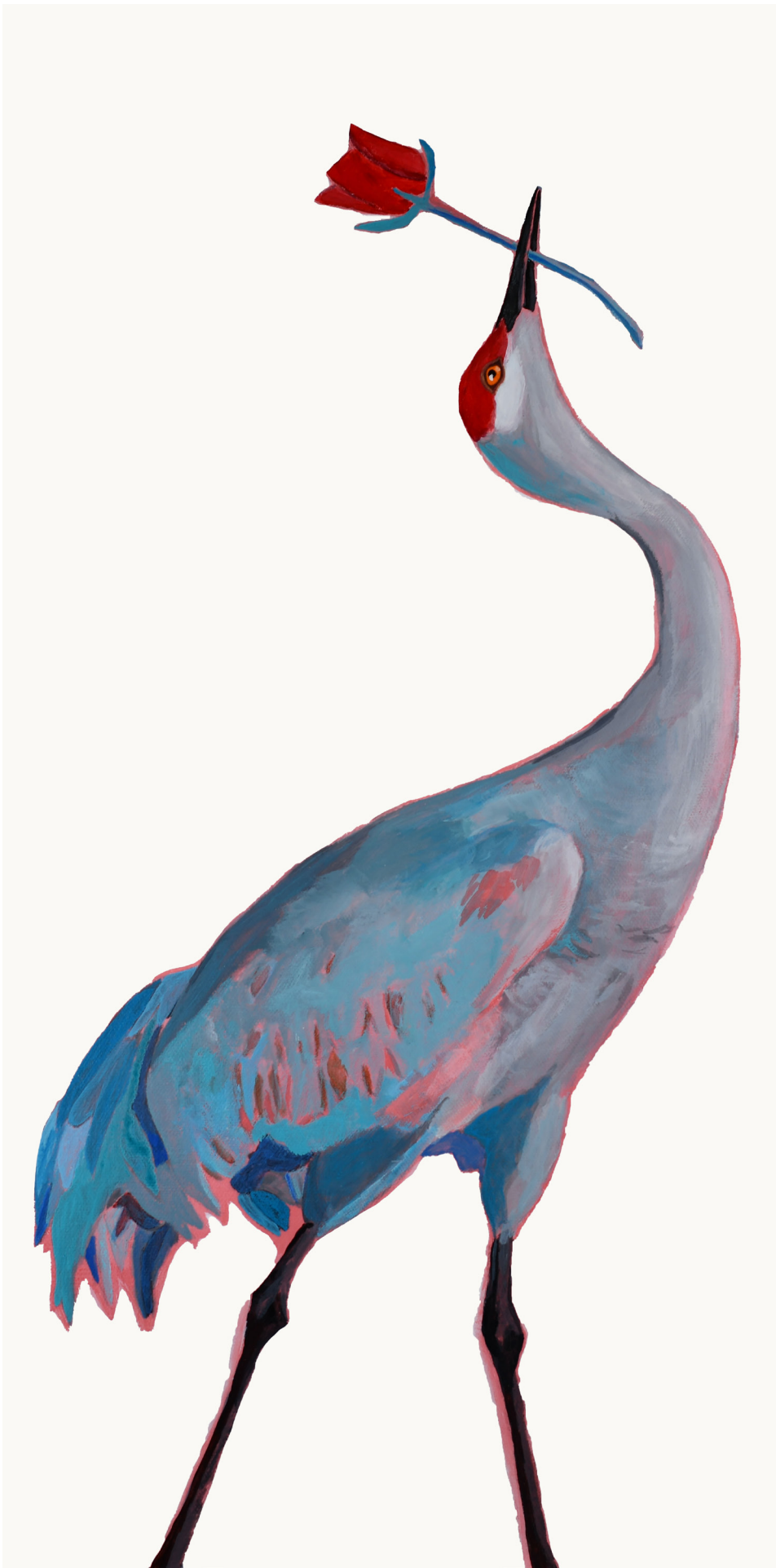
Crane Tango 2019 Acrylic on canvas

In the fields and on the river, cranes make a sport of tossing objects as high as they can. They will grab corn cobs, clumps of algae, sticks, or whatever is close. Crane Tango is a fanciful take on what they would do if roses were available.