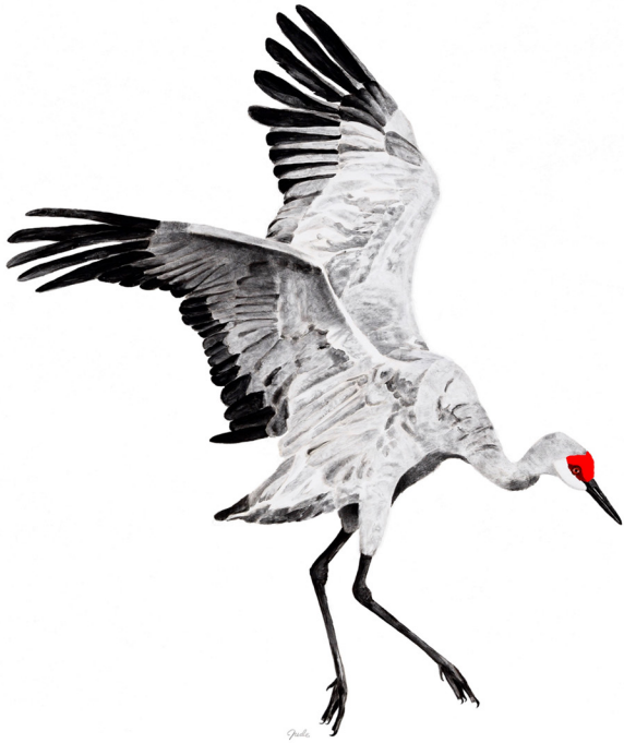
Crane Fever #3 2016 Acrylic on canvas