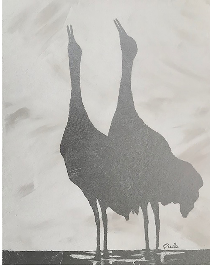
Unison Call 2018 Acrylic and aluminum leaf on canvas