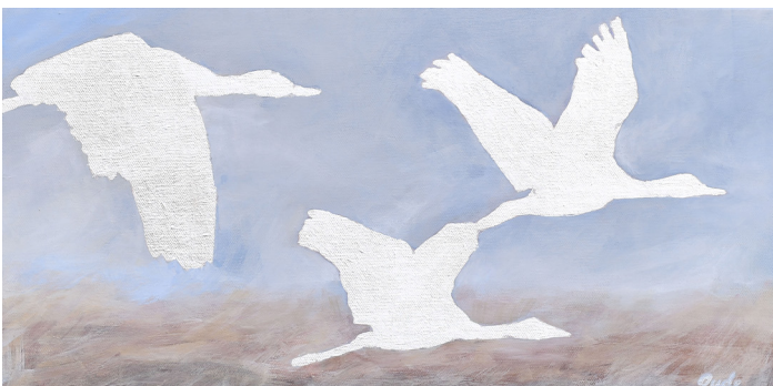
Homeward Bound #2 2019 Aluminum leaf and acrylic on canvas